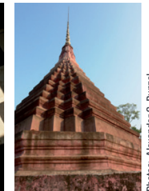
Stupa Wat Kamphaeng